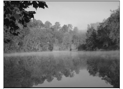
The Kiskiminetas River

...That's right, we really need you and all of your friends, business acquaintances, and relatives to go to a computer and vote RIGHT NOW for the Pennsylvania River of the Year and help the Kiski River achieve state and national recognition as a scenic wonder. This will do wonderful things for our river side communities. We came so close last year that it wasn't even funny! We were told that we were within a few hundred votes of being in first place but the Delaware River, with its huge population area, beat us by only a few hundred points. Well, they're not eligible to be in the running this year so I think if you tell everyone you know to vote, we will win this time . All voting will take place between now and midnight, December 31, 2011.